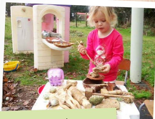
Mud kitchen playgroup

Nurture Nannies regularly organises events and playgroups to give the children the opportunity to socialise and have fun with other little ones from Nurture Nannies. To find out about upcoming playgroups and events, call 0800 936 878.